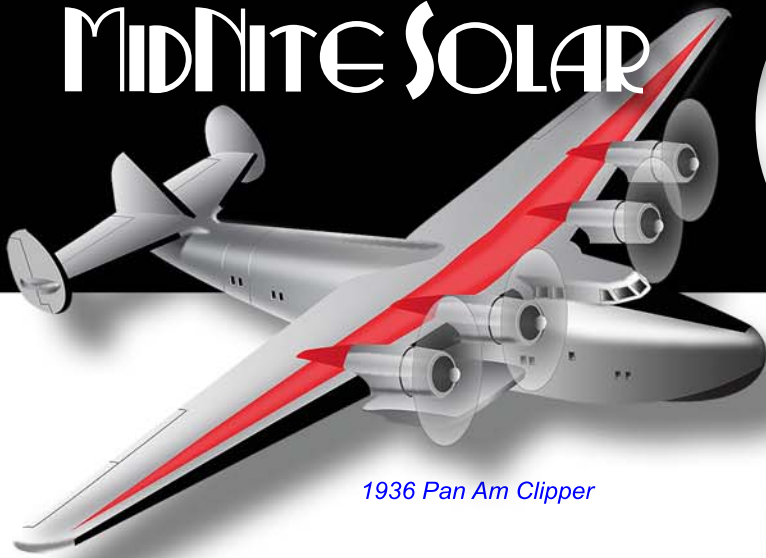
1936 Pan Am Clipper